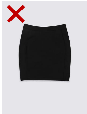
Tight fitting pencil/straight/tube